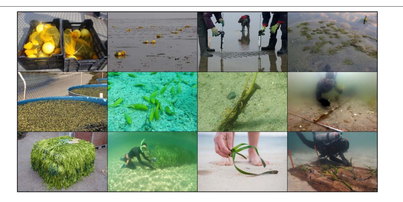
FIGURE 2 | Emerging tools and techniques developed within the international seagrass restoration community. First row left to right: buoy-deployed seeding, Dispenser Injection Seeding. Second row left to right: seagrass nurseries ; anchoring shoots using iron nails. Third row left to right: artificial in-water structures, and collection and use of alternative sources of transplantation.

This method is promising, especially for sites with strong tidal currents, such as the intertidal zone, where hand-casting and BuDS have not been very successful. However, direct injecting of seeds has yet to be trialed for other seagrass species and is likely more labor intensive compared to other seeding techniques such as hand-casting. The technique is also currently suitable for seeds between 0.5 and 4 mm in size, however, the equipment needed can be adjusted accordingly for different seed sizes. Additionally,